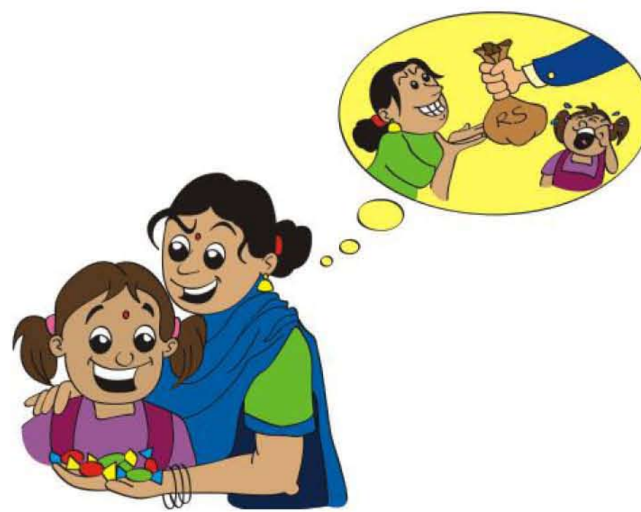
Tricking a child