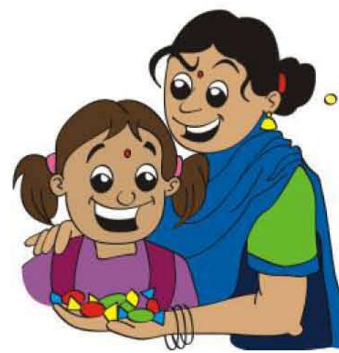
Tricking a child