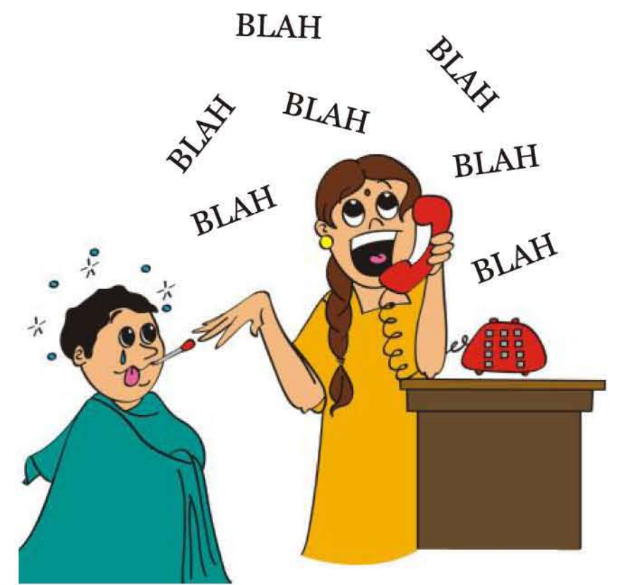
Disregarding a child's health needs