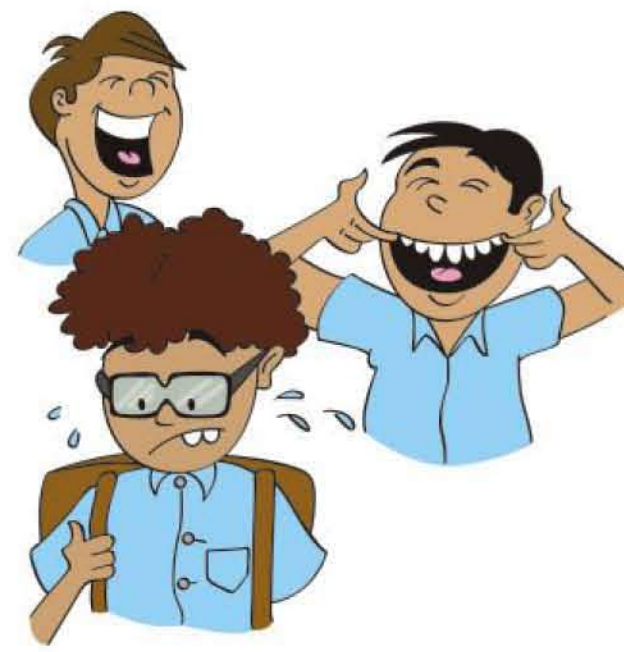
Making fun of a child