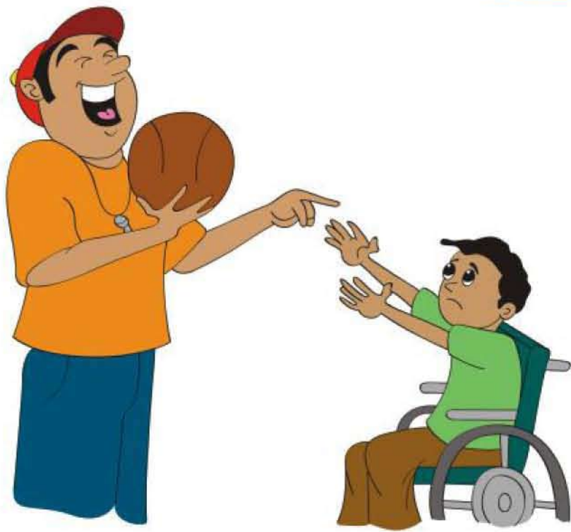
Ridiculing a child