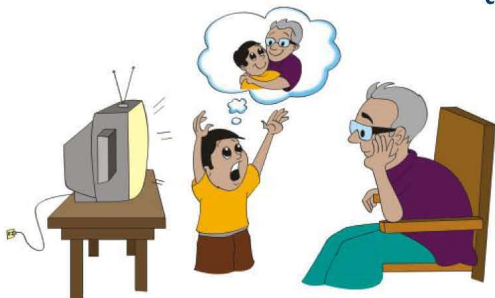
Ignoring a child's emotional well-being