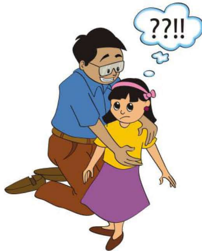
Touching a child in a way that makes the child feel confused, unsafe or uncomfortable