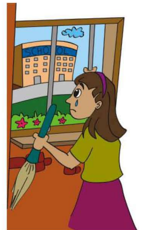
Not allowing a child to attend school