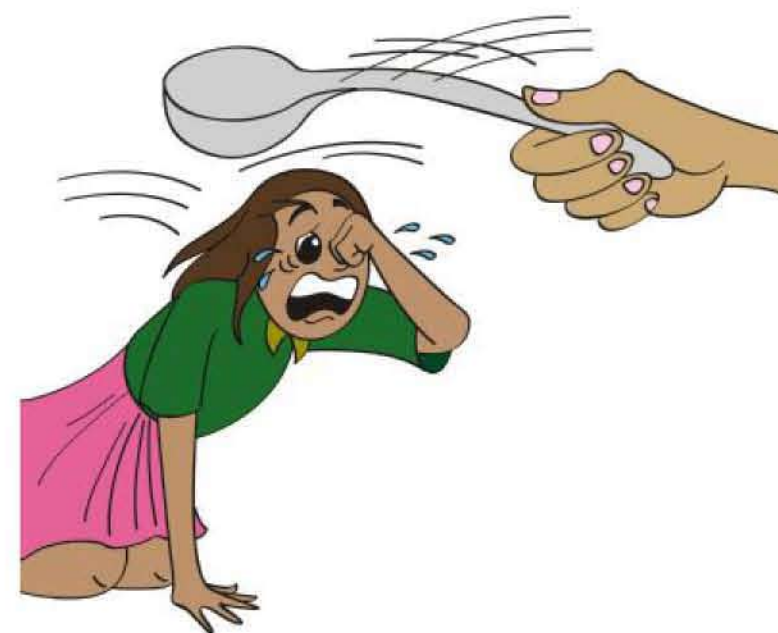
Beating a child