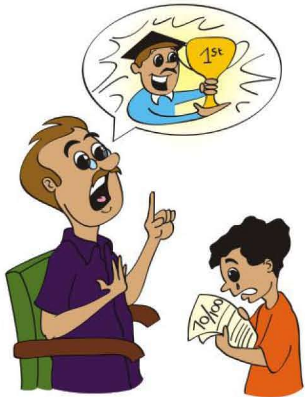
Pressuring a child to meet adult's needs and expectations