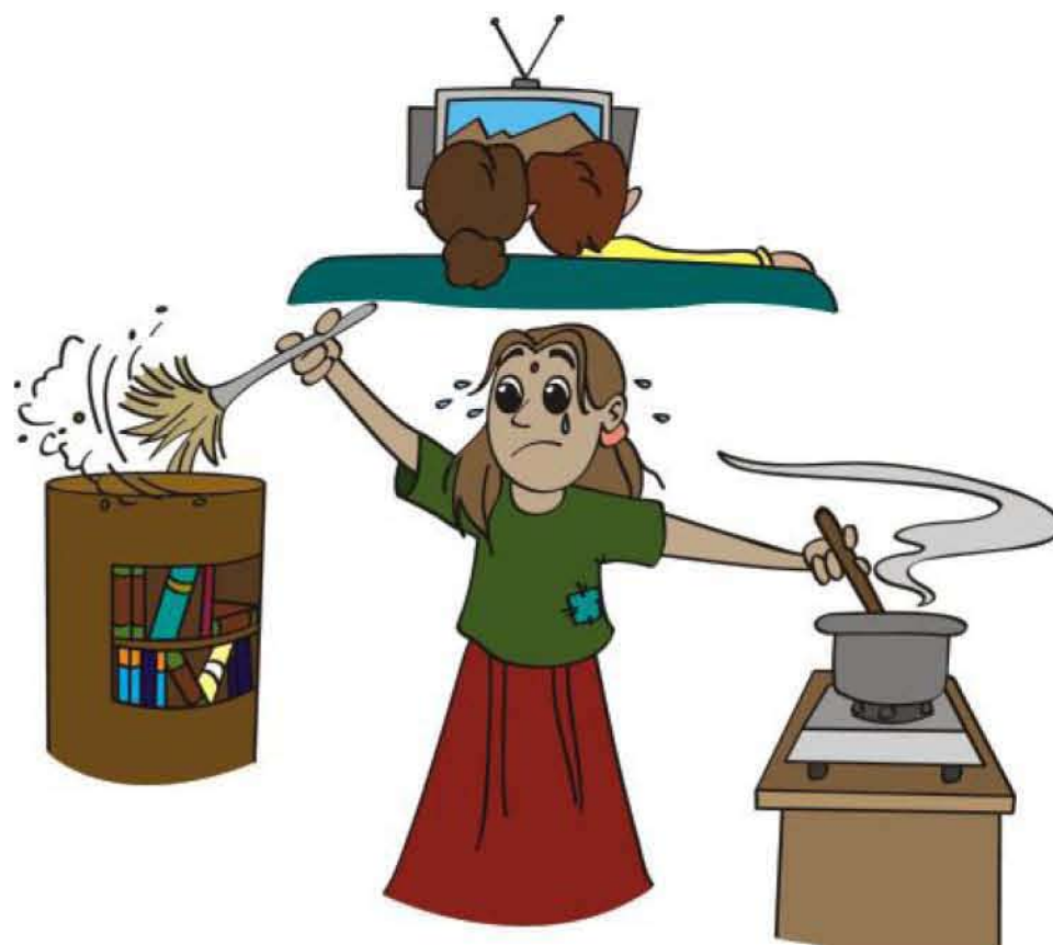
Employing a child to work in your house