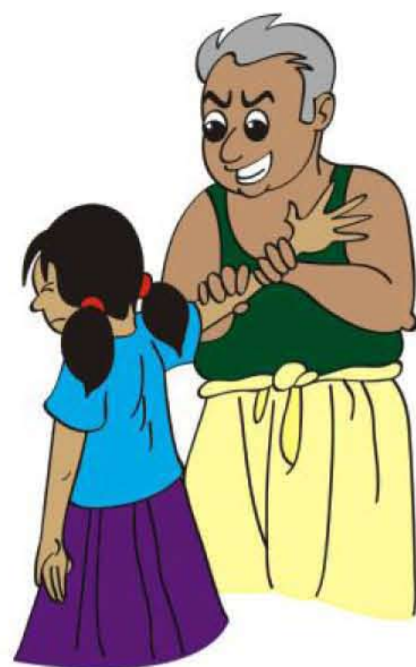
Forcing a child to touch you